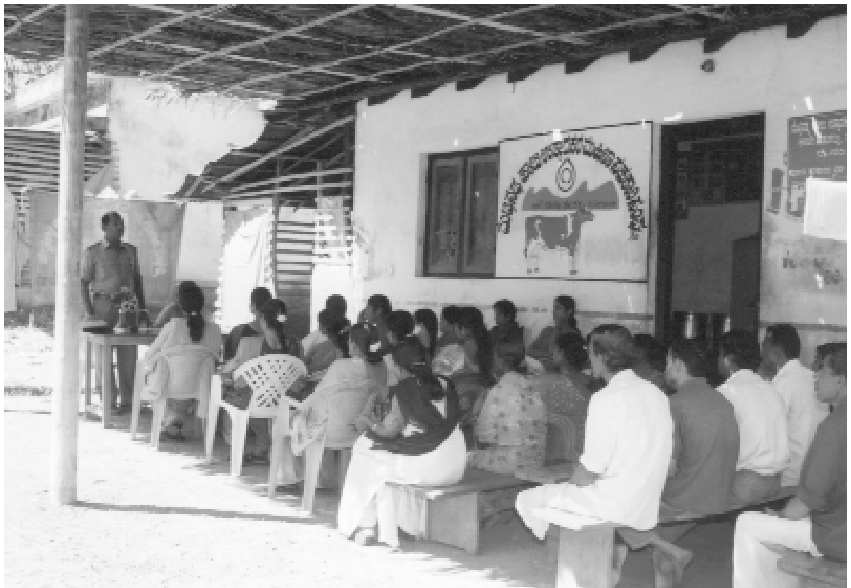
A Training Session under the STEP Programme in Karnataka

Sponsored by the Department of Women and Child Development, Government of India.