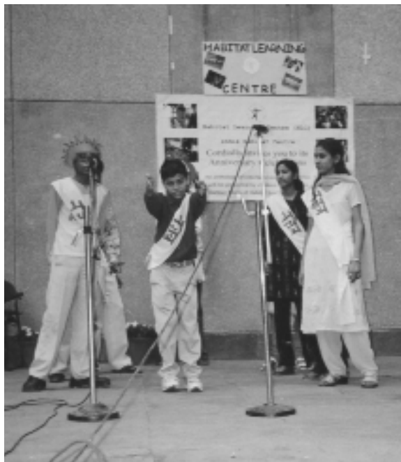
Nakshatra: The Children's Theatre Group at the India Habitat Centre.

The ISST Community Centre is continuing its regular programmes like 'Saheliyon ki Bari' for women in Basti Vikas Kendra, Nehru Camp. ISST