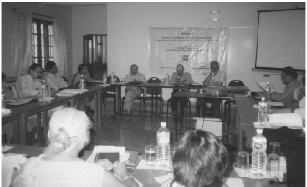
Workshop on Women's Livelihood in Coastal Communities at Bangalore

This activity was sponsored by Ford Foundation, India.