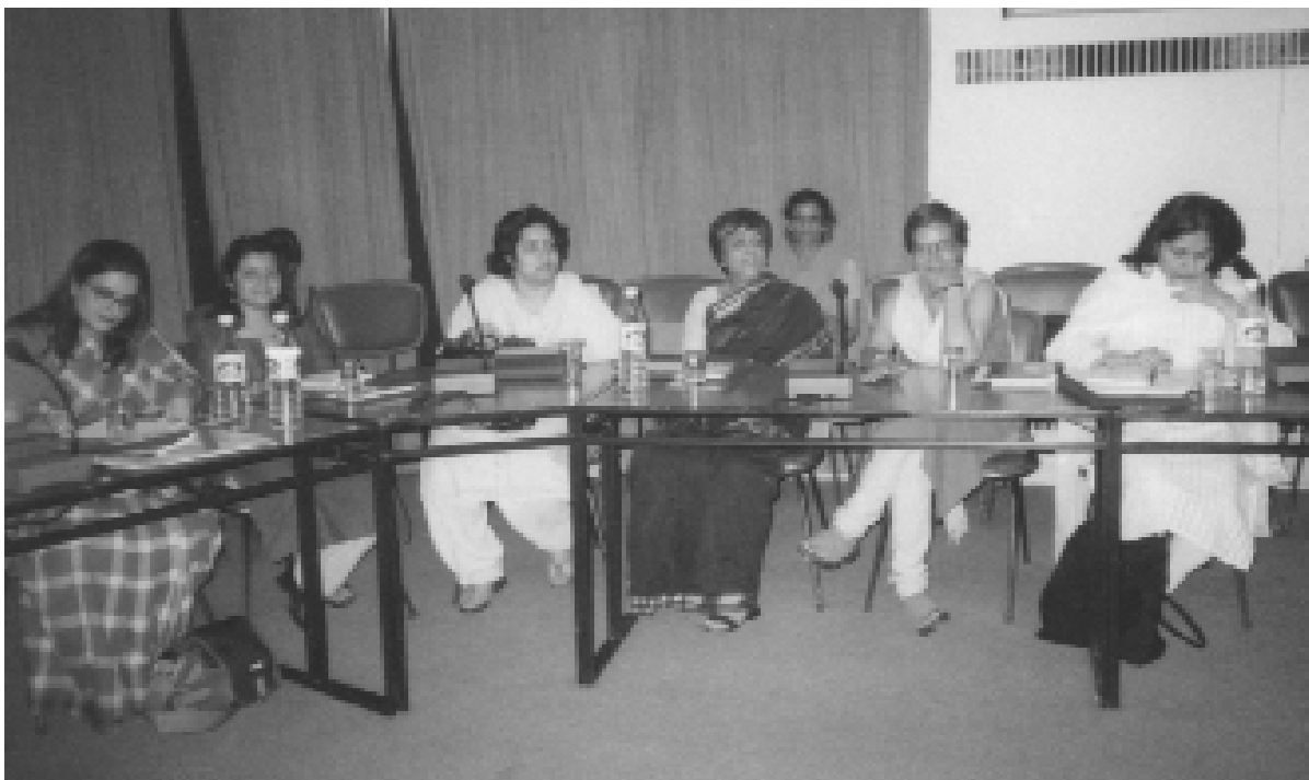
The Final Dissemination Seminar on Ensuring Public Accountability Project is under progress

groups for constructive dialogue with relevant official agencies on issues related to service delivery. Together with a couple of other community based organizations, the project identified the problems in the service delivery system in three slum clusters in east Delhi. Different priority needs were identified including garbage collection, sanitation, sewerage connections and community toilet blocks. At the same time, the project organized participatory 'Area Workshops' with the slum residents and tried to build community awareness towards the 'right to participate' and the 'right to information' in issues related to governance. ISST has documented the entire project process and the research issues in its final report. A short documentary film has also been made as a part of the project documentation.