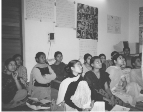
A Training Workshop with the adolescent girls is under progress at ISST Community Centre.