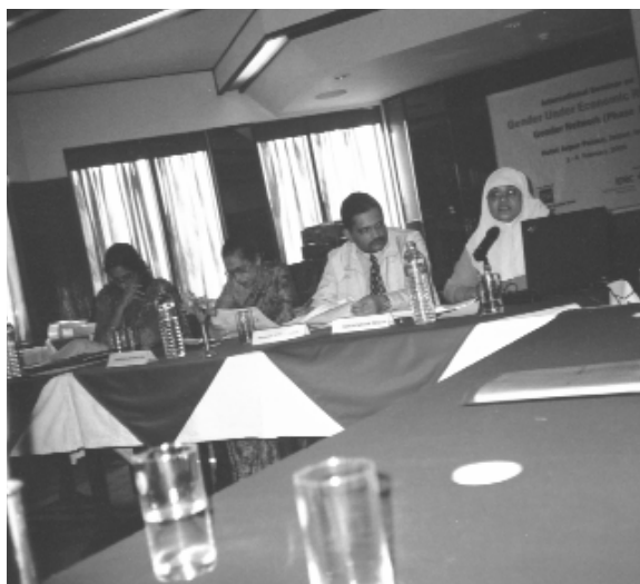
International Seminar on Gender Under Economic Reforms at Jaipur.

The International Seminar on Gender Under Economic Reforms, the last seminar of the Gender Network Project was organized at Jaipur between February 1 and 4, 2006. The seminar brought together several gender researchers both from partnering organizations and others as well as scholars outside the network. All the research findings were presented at the seminar. Two panel discussions were arranged during the seminar: Gender in Kerala and A Round Table Discussion on Action Research Policy Triad in Gender Studies.