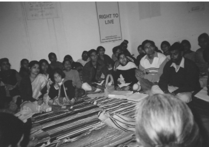
A Workshop on Right to Information is being held at ISST Community Centre