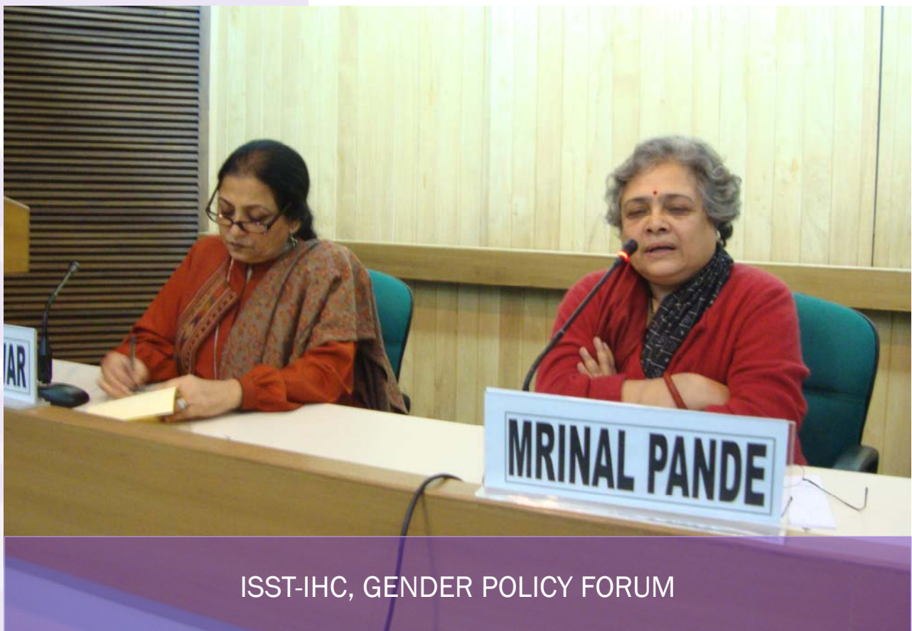
ISST-IHC, GENDER POLICY FORUM