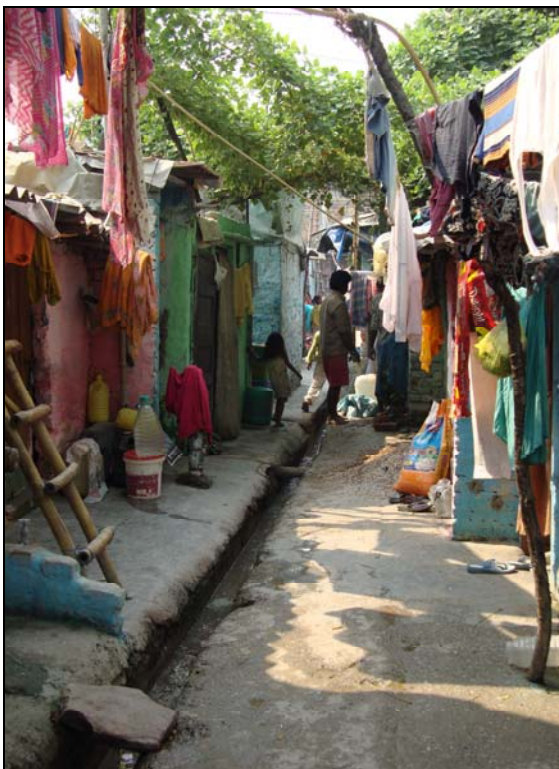
Cluster settlement, Kalyanpuri