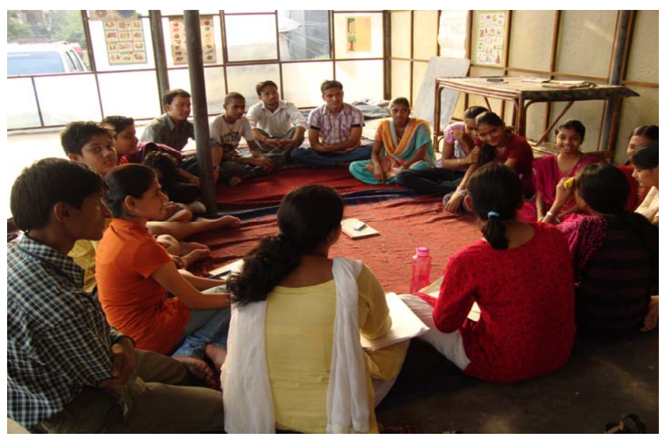
Focus group discussion with young boys and girls, Kalyanpuri

Both boys and girls spoke of girls having to negotiate their life-style to suit the needs of the husband, even accepting violence if needed. The fact that girls in the present society do not have the freedom to choose their spouse is itself a form of violence. Any movement in public spaces by a girl is not free of judgement by neighbours. While both girls and boys have to face restrictions, girls have to face much more. Some participants believed that one has to do things according to the society's expectations, and if people wish to defy the social norms, they will have to face many obstacles.