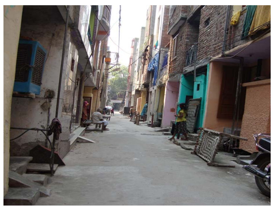
Block settlement, Kalyanpuri

The objective of the study was to understand what factors prevent women from seeking help if they find themselves in violent situations, and what in their view and the views of men, youth and duty bearers in the area, are the best ways of reducing the incidence of violence.