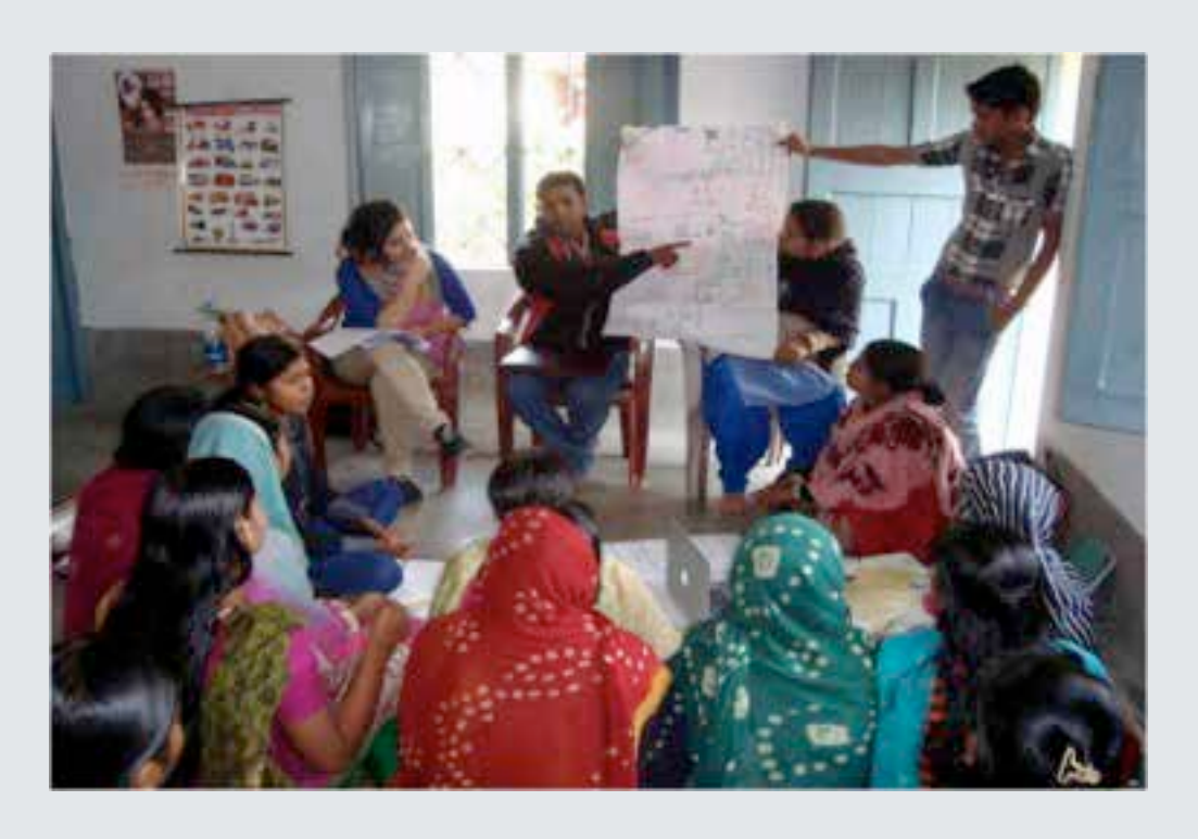
FIGURE 2: AN ADOLESCENT GIRL PRESENTING THE DREAM FOR THE SABLA PROJECT DURING A FOCUS GROUP DISCUSSION IN A VILLAGE IN WEST BENGAL

NGO staff and community representatives were engaged and supported the evaluators during focus group discussions, as they had been involved in drafting the evaluation questions. One discussion began with adolescent girls from the workshop presenting their dream for the project with the rest of the group (see Figure 2). This motivated the participants to speak freely about the SABLA program and what role they and others could play in the process of implementing the project. Though not part of the original plan, the evaluation team conducted focus group discussions with boys and