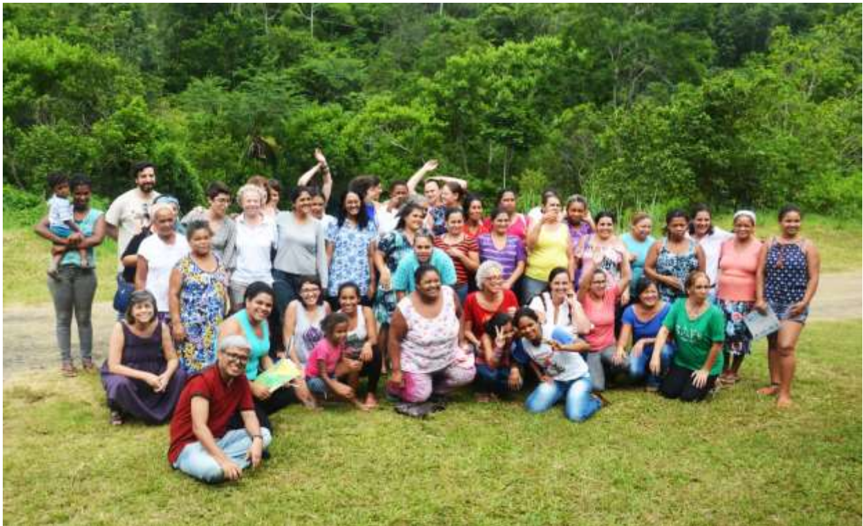
Picture 2: The Solidarity Economy global Project team in Brazil, February 2017

In February, 2017 ISST participated in a five-day midterm workshop on the project in São Paulo, Brazil. Its main objective was to discuss the advancement of the different case studies of the research at the end of the first year of the project, and to identify common