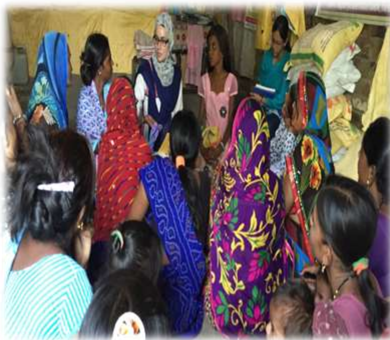
Picture 1 Focused Group Discussion with Women Workers in Indore, May 2016

The project aims to create knowledge about how women's economic empowerment (WEE) policy and programming can generate a 'double boon': paid work that empowers women and provides more support for their unpaid care work responsibilities. ISST used a mixed methods approach to study state and non-state programmes in India and Nepal. The research findings