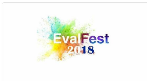
EvalFest 2018: Visibility, Voice, and Value EvalFest 2018 Day 1, 7 February 2018 A consultation o... eventbrite.com

Exploring and Strengthening link between Evaluations and SDG. #EvalFest18 #EvalFest Register at eventbrite.com/e/evalfest-2018 ... @ECOL_India @nabesh_bohidar @evalcoindia @rituubnanda